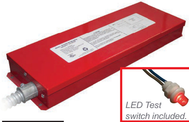
LED Test switch included.