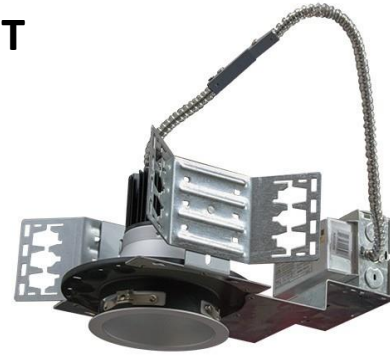
Image shown with trim & frame. Each item ordered separately.